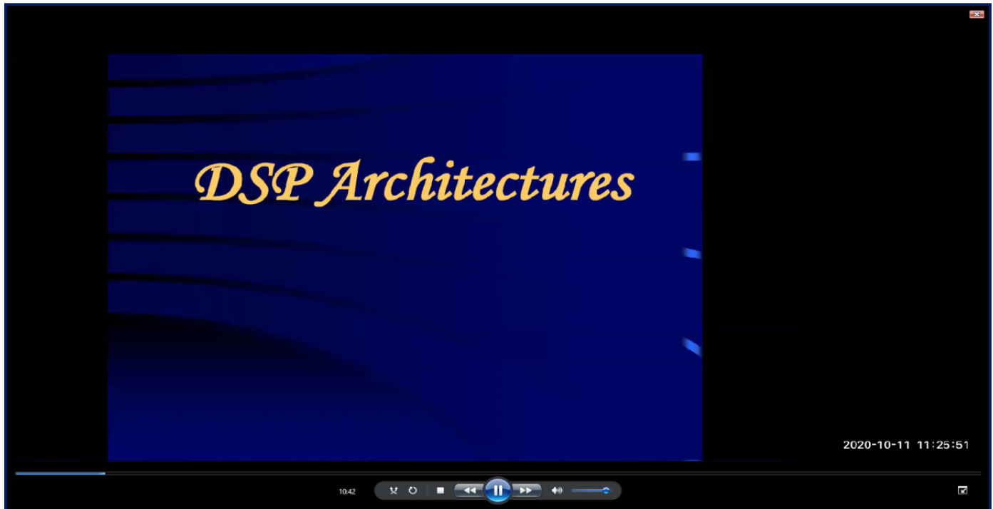
Figure: Resource Person explaining about DSP Architectures